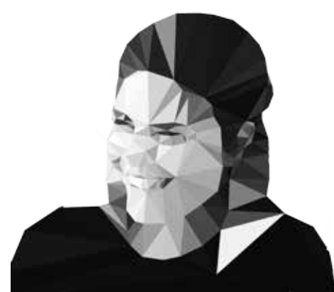
Technical Assistant AstroLab