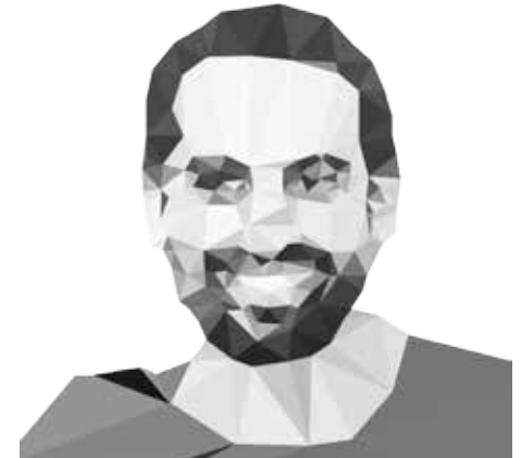
Technical Manager AstroLab