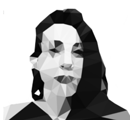
Operational Manager AstroLab